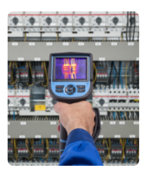
Note: pictures are for illustration purposes only.